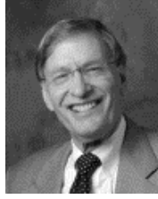
Allan H. Selig Age 71 Director since 1969 Commissioner of Major League Baseball President and Chairman of the Board, Selig Lease Company