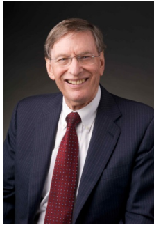
Allan H. Selig