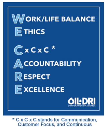
C x C x C stands for Communication, Customer Focus, and Continuous Improvement.

Oil-Dri is committed to doing business in a sustainable and socially responsible manner, which we believe will drive long-term value creation for our company and all of its stakeholders, as well as managing the risks and opportunities that are presented by Environmental, Social, and Governance ("ESG") issues. At the heart of everything we do is our "WE CARE" values. These values apply not only to our employees, who we refer to as our "teammates", and production facilities, but we also seek to engage with customers, vendors, and other stakeholders who align with our values as well as those reflected in the communities in which we live and work.