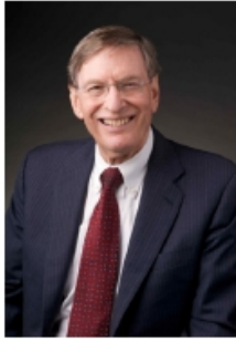
Allan H. Selig