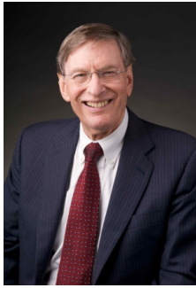
Allan H. Selig